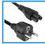
Power cable Europe PN: 1005794-01