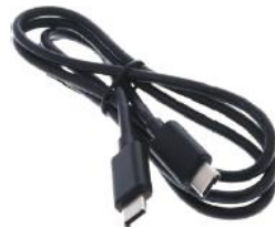
Usb-C cable: Serial connection to the Sokkia GRX5 to a Field controller to install firmware or download raw data. This cable can also be used to charge the Sokkia GRX5 receiver. PN: 1068615-01