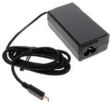
Usb-C AC charger: Used to charge the internal batteries of the Sokkia GRX5 receiver. Use with the power cable for the correct region. PN: 1068616-01