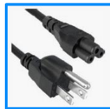
Power cable North America PN: 1005793-01