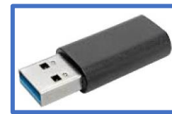
Usb-C to USB-A adapter: Use for controllers or computers that do not have a USB-C port. PN: 1068617-01