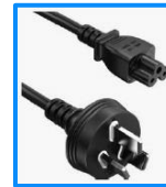
Power cable Australia PN: 1021180-01